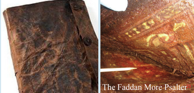
The Faddan More Psalter