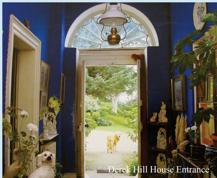
Derek Hill House Entrance