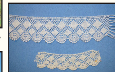
Sample of Lace