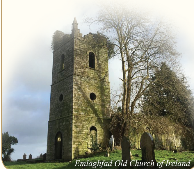
Emlaghfad Old Church of Ireland

The Corran Herald reflects a unique blend of styles and subjects and holds the interest of a growing readership from year to year.