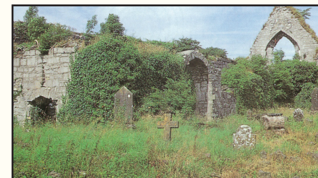
The Ruined Franciscan Friary, Ballymote

Ballymote Heritage Group would like to acknowledge financial support approved by Sligo County Council under the Community and Voluntary Sector Grant Scheme 2023.