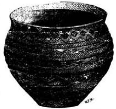
-Clonary Urn found near Ballymote.