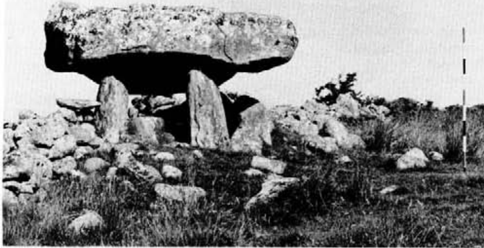
Tawnatruffan Portal Tomb