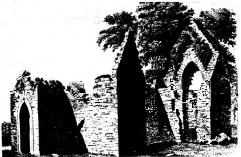
BALLYMOTE CHURCH, Co Sligo