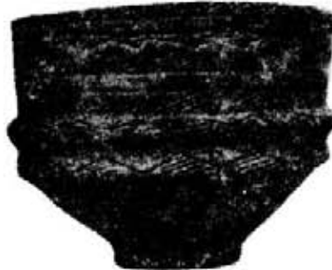
THE STONE PARK FOOD VESSEL

The space is sufficient to contain the body on it's side with the knees up. A food urn was placed in the right-hand corner close to the head. This urn is now at the National Museum and is a very nicely decorated piece of pottery. The photostat copy which I include (Fig.2) may fail to illustrate this but the second urn which I include (Fig 3) will illustrate the skill of the potter. This one was also found 'near Ballymote'. Cists belong to the early Bronze Age so Andy Walsh's cist was likely to be approaching 4000 years old. They are occasionally unearthed in ploughing or land reclamation. This one received special attention which makes it more interesting.