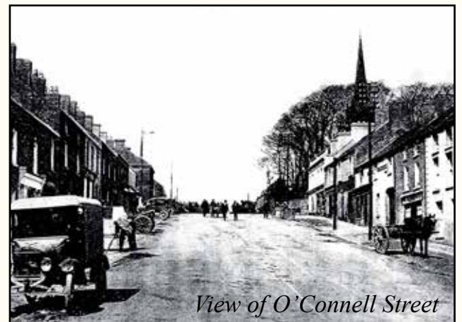
View of O'Connell Street

A walking tour drawing attention to important buildings and street development from the medieval to the modern." Meets at the front of the castle @ 3:30 pm