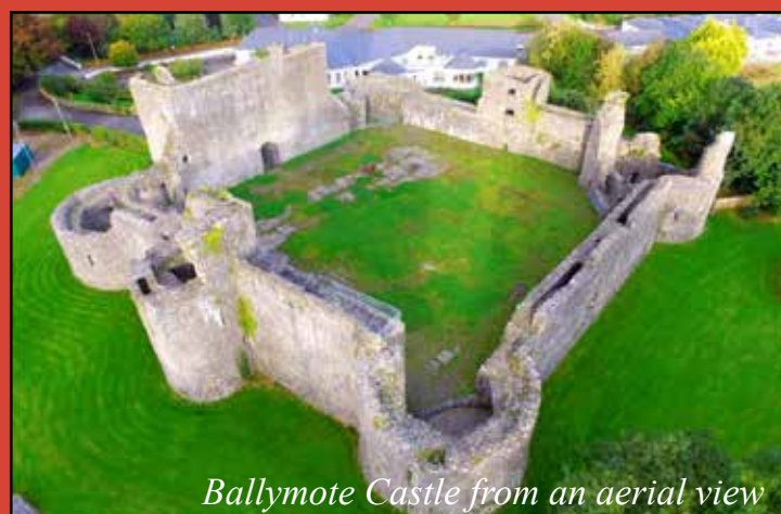
Ballymote Castle from an aerial view