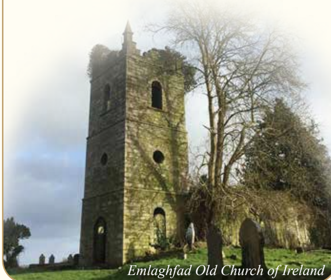
Emlaghfad Old Church of Ireland

The Corran Herald reflects a unique blend of styles and subjects and holds the interest of a growing readership from year to year.