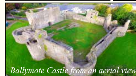
Ballymote Castle from an aerial view